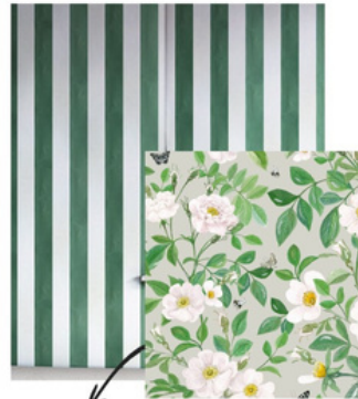
WALLPAPER FOR WOW ROOMS