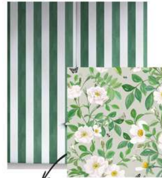
WALLPAPER FOR WOW ROOMS